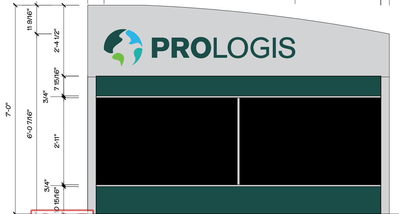
2 FRONT ELEVATION - SIDE B (2 PANEL OPTION) 2 1/2" = 1' - 0"